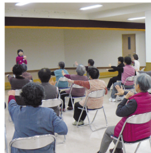
Thick bones Health Club