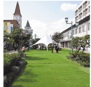
Social Experiment in Nakagomi Shopping Street