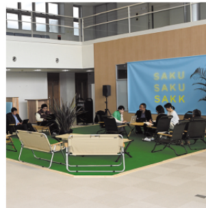
Work Terrace Saku