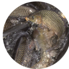
Official City Fish Saku Carp