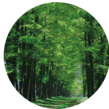
Official City Tree Japanese Larch

The official emblem of Saku City is the hiragana symbol 「Sa」 stylized as a bird spreading its wings and ready to take flight. This design expresses the great strides being made to create a prosperous future for Saku City. It embodies the hope for a strong and engaging town planning initiative where each resident can shine.