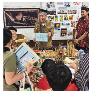
International Exchange Festival