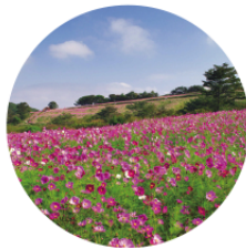
Official City Flower Cosmos