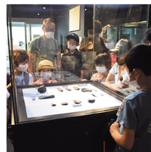
Archaeological Exhibition Room (Stone Blade Excavated at Kosakayama site)