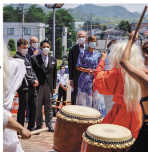
Visit of the President of the Republic of Estonia