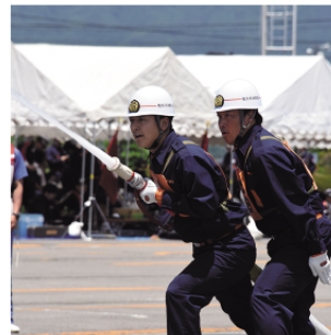
Saku City Fire Brigade Fire Pump Photo (left) Saku City Disaster Prevention Drill Photo(right)