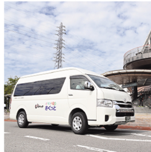
Demand traffic " Sakutto "