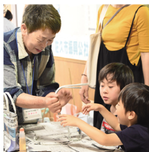
Tour of the Children's Festival