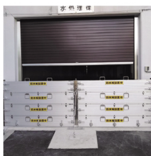
Waterproof plate in Saku City Sewage Management Center

Environmental Hygiene (Sanitation), Water Supply, Sewerage